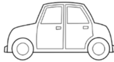
Toy Car 59¢