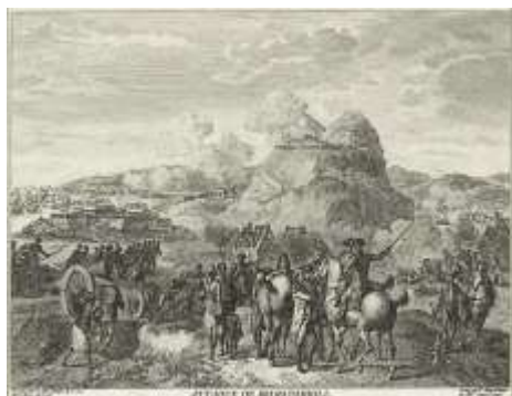
Revolutionary War Battles

Cut out each card and learn about the battles. Stack them shortest to longest and staple.