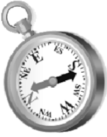
Compass 200 BC

Cut out each rectangle and glue the pieces onto the timeline in chronological order. Remember that BC works backwards, the bigger the number the longer ago it was. The BC all go on one timeline. The AD on the other. There are more picture/date cards on the next page.