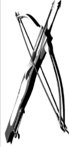
Crossbow 500 BC