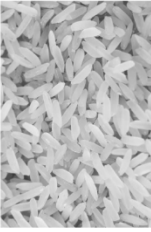
Growing Rice 4000 BC