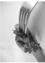
Fork 2400 BC