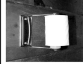
Toilet Paper 589 AD