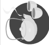
Tea 2000 BC