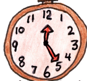
The ticking of a clock is rhythm.