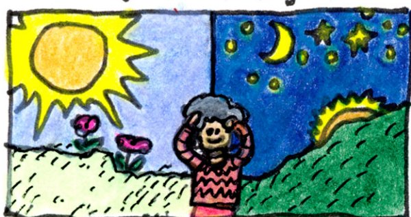
The day has a rhythm to it. Sunrise... sunset... Sunrise... sunset...