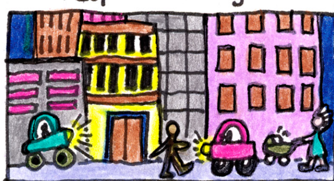
The city has a rhythm.