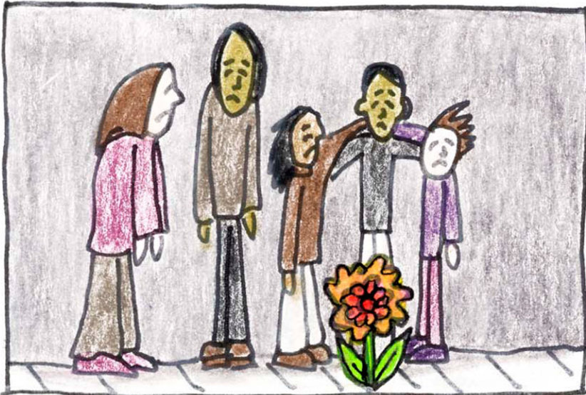
A beautiful flower growing in a grey, dismal setting.

FOCUS-MAIN IDEA-WHAT "GRABS" MY ATTENTION?