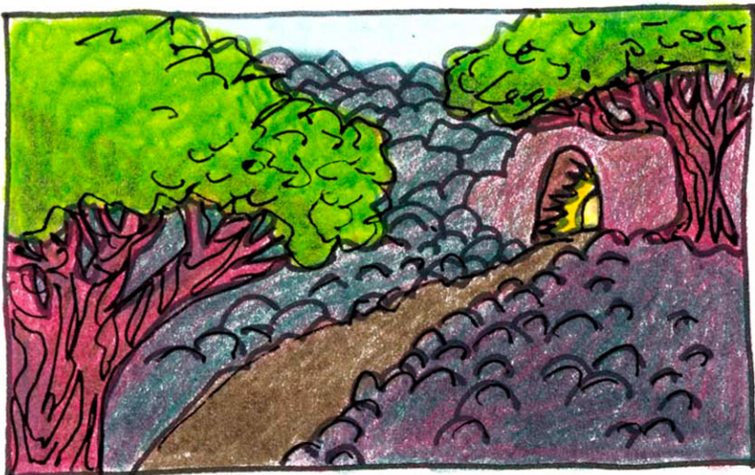
The light at the end of a tunnel