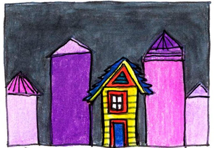
A house that stands out from the rest