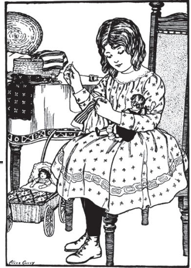
Heidi learns to make doll clothes